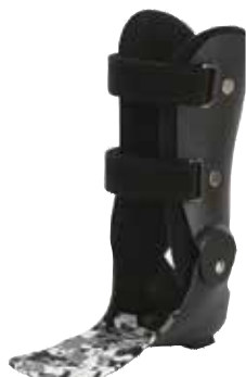
Sure-02 Pro Custom