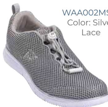
WAA002MSIB Color: Silver Lace

Runs short 1 full size & narrow 1 full width