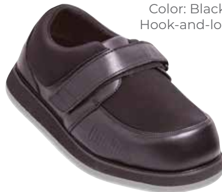
628-E Color: Black Hook-and-loop