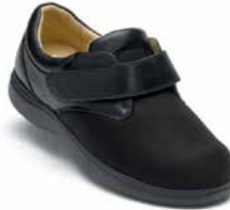
S626-1 Color: Black Hook-and-loop