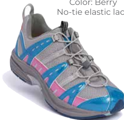
3976 Color: Berry No-tie elastic lace