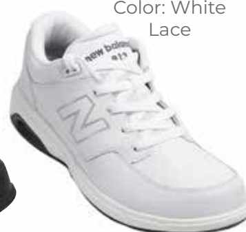
MW813WT Color: White Lace