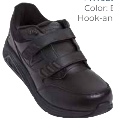
MW928HB3 Color: Black Hook-and-loop