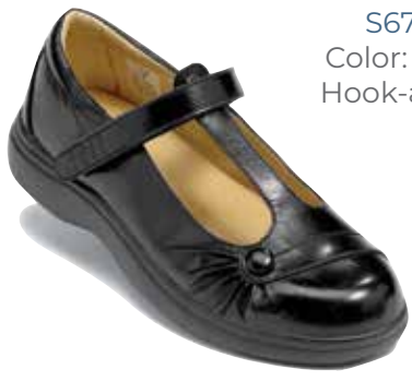
S676-1 Color: Black Hook-and-loop