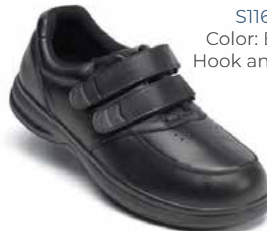
S116-1 Color: Black Hook and loop