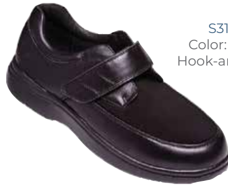
S310-1 Color: Black Hook-and-loop