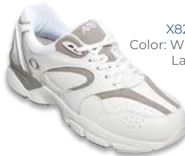
X821M Color: White/Gray Lace