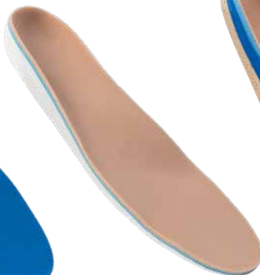
Tri-Laminated EVA Base Accommodative