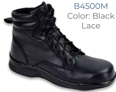
B4500M Color: Black Lace