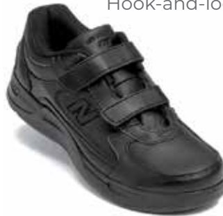
WW577VK Color: Black Hook-and-loop