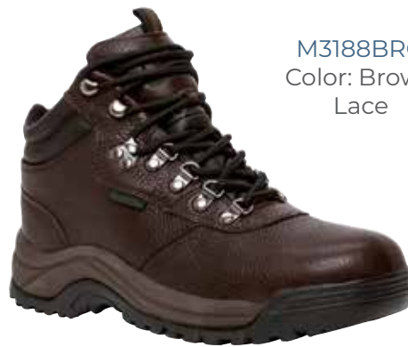
M3188BRO Color: Brown Lace