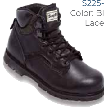
S225-1 Color: Black Lace