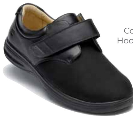
S166-1 Color: Black Hook-and-loop