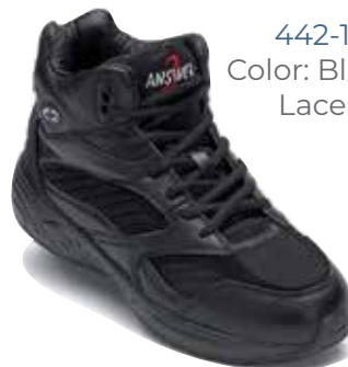
442-1 Color: Black Lace