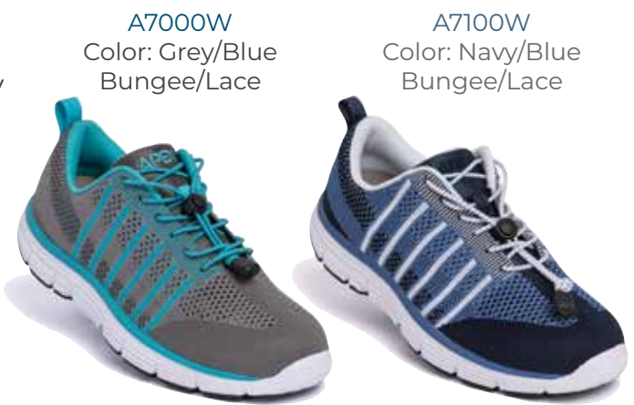
A7000W Color: Grey/Blue Bungee/Lace