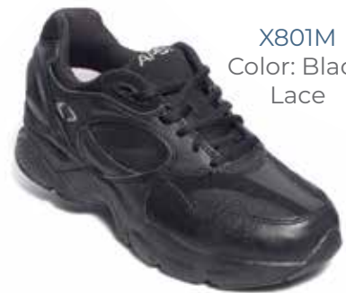
X801M Color: Black Lace