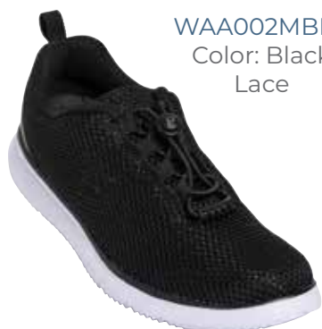
WAA002MBLK Color: Black Lace