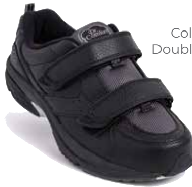
7710 Color: Black/Grey Double hook-and-loop