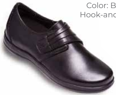
A830 Color: Black Hook-and-loop