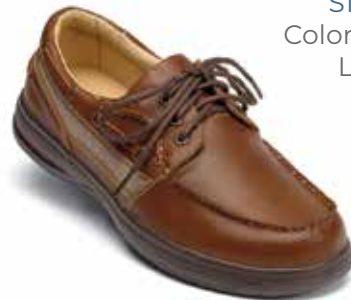
S175-2 Color: Brown Lace