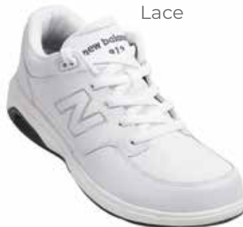
WW813WT Color: White Lace