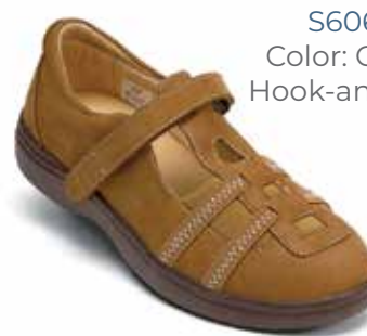
S606-2 Color: Camel Hook-and-loop