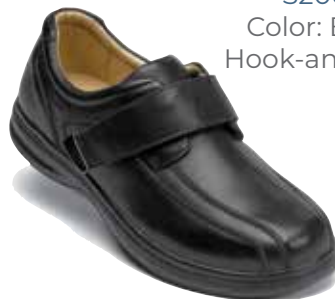
S206-1 Color: Black Hook-and-loop