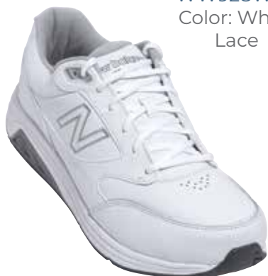
WW928WB3 Color: White Lace