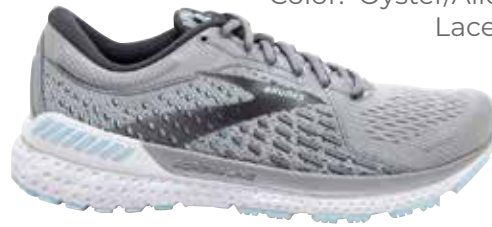
120329-061 Color: Oyster/Alloy/Light Blue Lace

*Orders will be filled with available stocked color until inventory has been depleted.