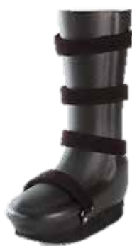
Sure-07 Crow Boot