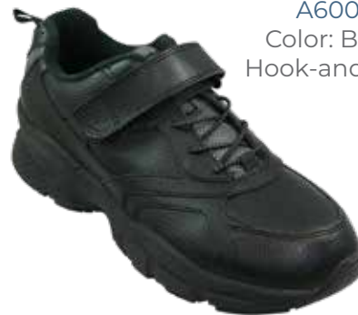
A6000 Color: Black Hook-and-loop