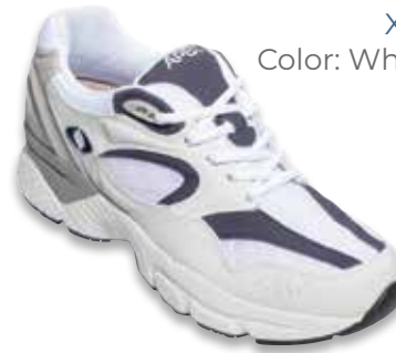
X521M Color: White/Blue Mesh Lace