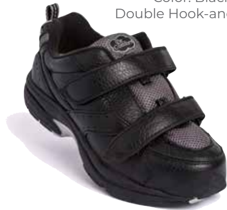
2410 Color: Black Double Hook-and-loop