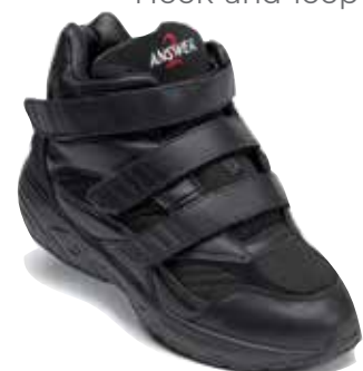
441-1 Color: Black Hook-and-loop