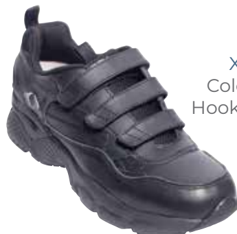
X903M Color: Black Hook-and-loop