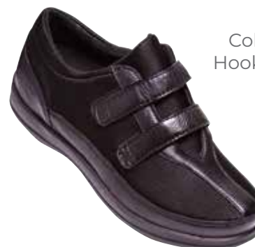
A730 Color: Black Hook-and-loop