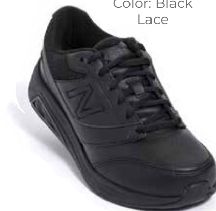
WW928BK3 Color: Black Lace