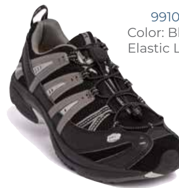
9910 Color: Black Elastic Lace