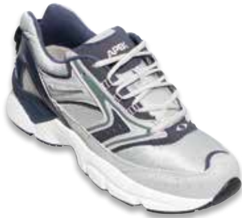
X532M Color: Silver/Navy Lace Features Lockdown™ Heel Strap