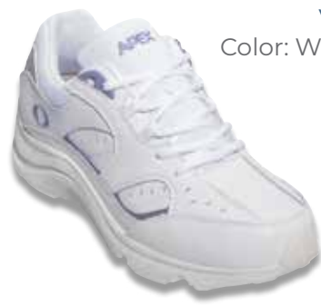
V854W Color: White/Periwinkle Lace