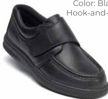
H18800 Color: Black Hook-and-loop