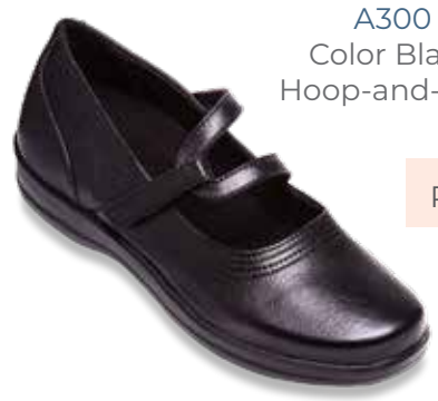
A300 Color Black Hoop-and-loop