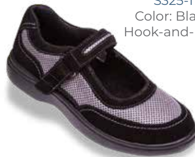
S325-1 Color: Black Hook-and-loop