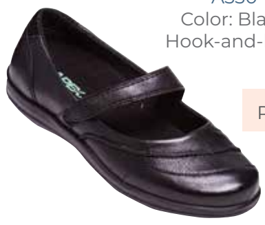
A330 Color: Black Hook-and-loop