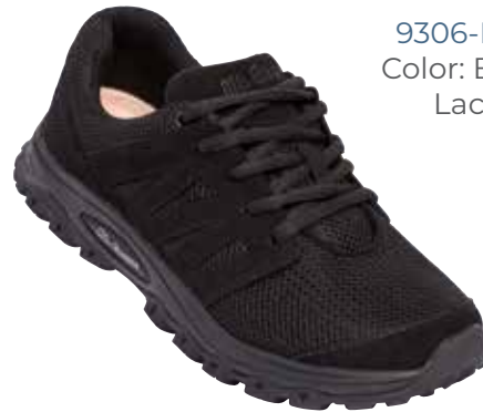
9306-BLK Color: Black Lace