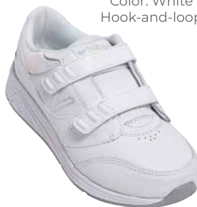
WW928HW3 Color: White Hook-and-loop