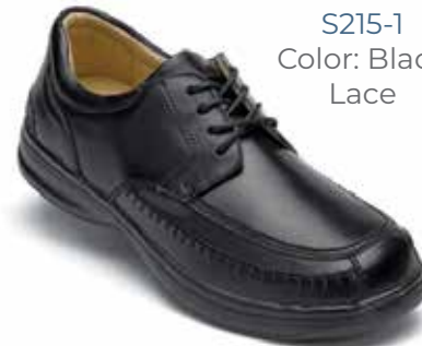
S215-1 Color: Black Lace