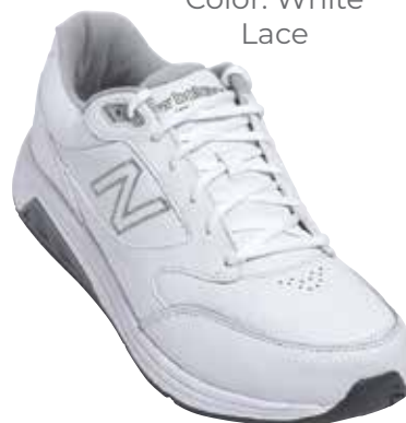
MW928WT3 Color: White Lace