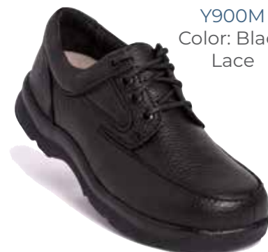
Y900M Color: Black Lace