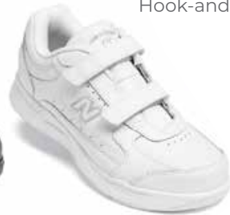
WW577VW Color: White Hook-and-loop