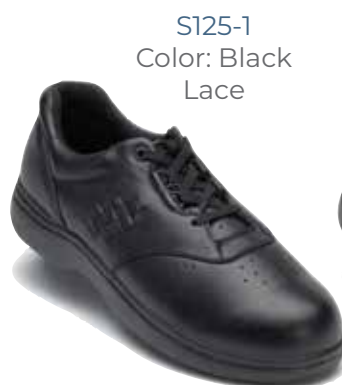
S125-1 Color: Black Lace