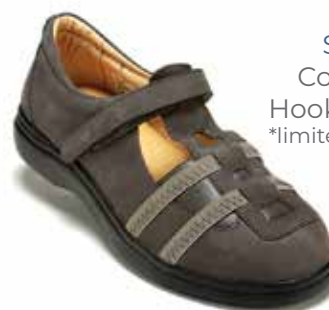
S606-8 Color: Gray Hook-and-loop *limited availability