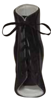
Sure-14 Standard Solid Ankle