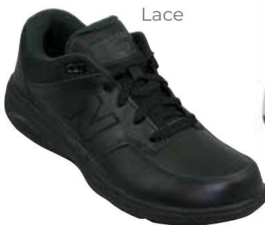
MW813BK Color: Black Lace