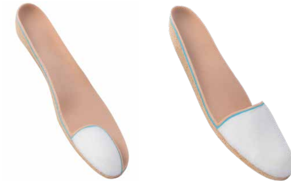
Toe Fill Orthotics for Hallux, trans metatarsal and Multi-Toe Amputations