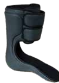
Sure-19 Intersect-Stabilizer Brace