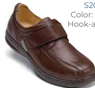
S206-2 Color: Brown* Hook-and-loop