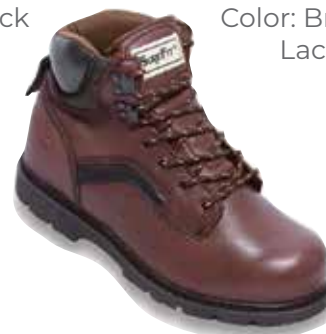
S225-2 Color: Brown* Lace

*Brown appears darker in catalog. It is a lighter brown.