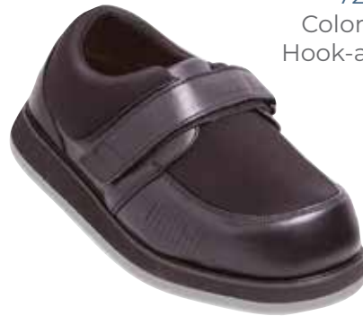
728-E Color: Black Hook-and-loop