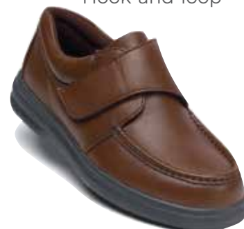
H18801 Color: Brown Hook-and-loop

*Shoe runs narrow (1 full width) *M width runs true in length *W width runs (1/2 long) *EW width runs (1/2 long)