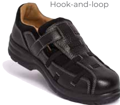
3810 Color: Black Hook-and-loop