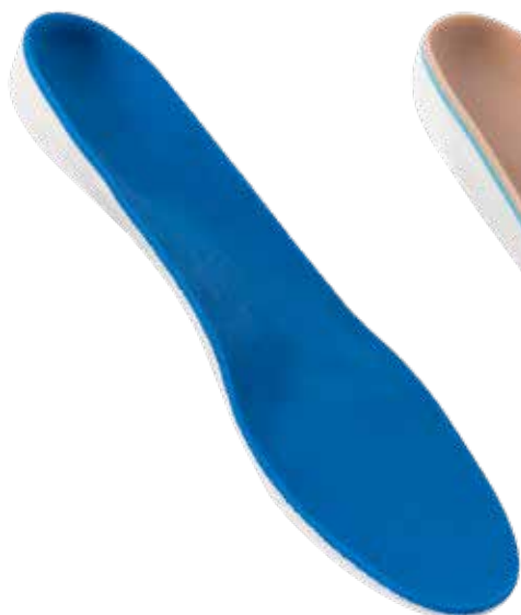
Bi-Laminated EVA Base Accommodative