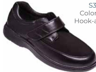
S320-1 Color: Black Hook-and-loop