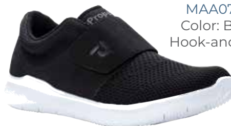
MAA073M Color: Black Hook-and-loop