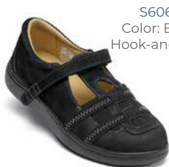
S606-1 Color: Black Hook-and-loop