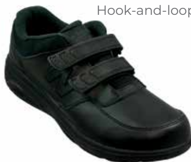
MW813HBK Color: Black Hook-and-loop