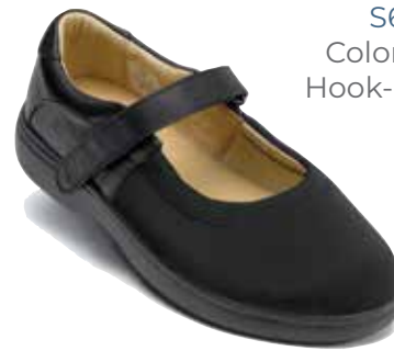
S636-1 Color: Black Hook-and-loop