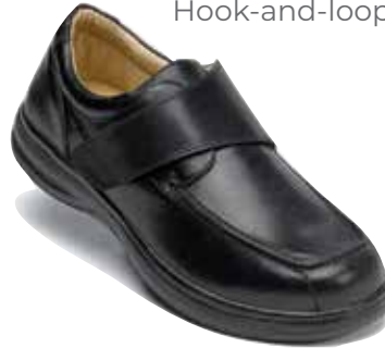
S196-1 Color: Black Hook-and-loop