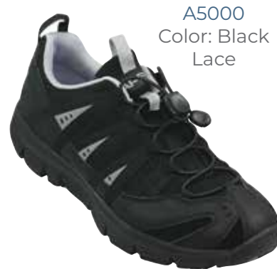
A5000 Color: Black Lace