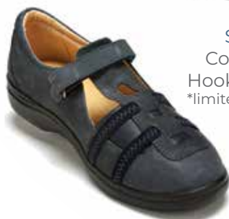
S606-7 Color: Navy Hook-and-loop *limited availability