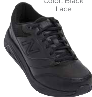
MW928BK3 Color: Black Lace