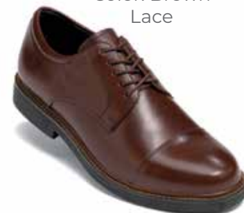
LT610M Color: Brown Lace