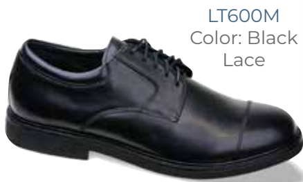
LT600M Color: Black Lace