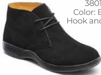
38010 Color: Black Hook and Loop