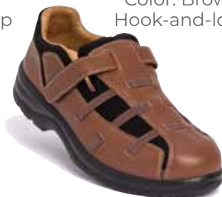
3820 Color: Brown Hook-and-loop