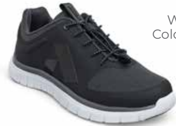
W023-SHOE Color: Black/Gray Lace