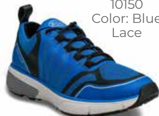
10150 Color: Blue Lace