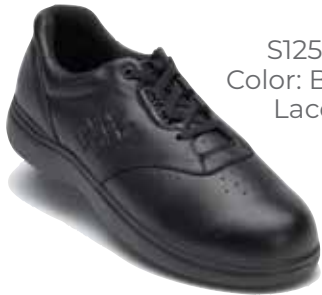
S125-1 Color: Black Lace