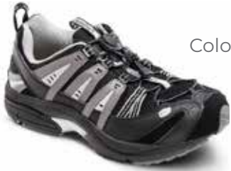
9910 Color: Black/Gray Lace