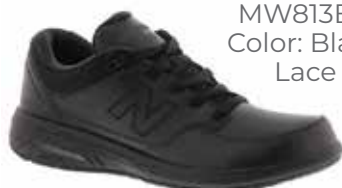
MW813BK Color: Black Lace