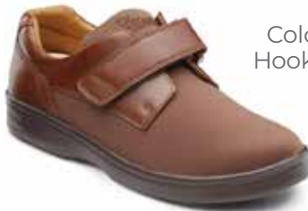
4520 Color: Brown Hook and Loop