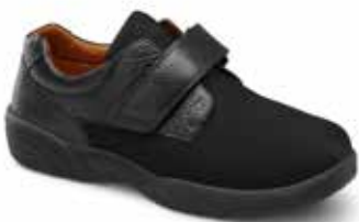
6910 Color: Black Hook and Loop