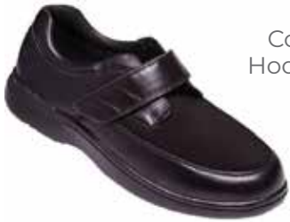
S320-1 Color: Black Hook-and-loop