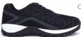
9705-BLK Color: Black Lace