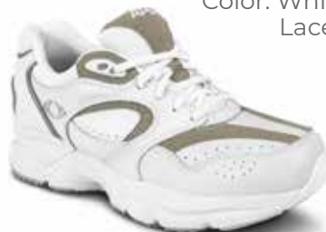
X821W Color: White/Gray Lace