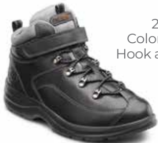
2510 Color: Black Hook and Look