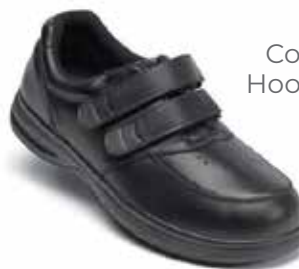
S116-1 Color: Black Hook and loop