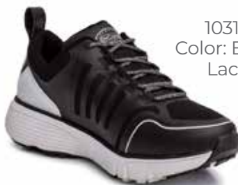
10310 Color: Black Lace