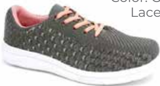
9327-GRY Color: Gray Lace