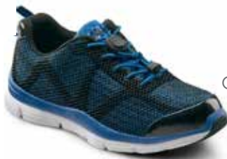
77750 Color: Blue Lace