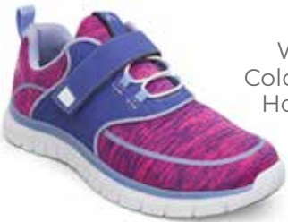
W045-SHOE Color: Purple/Pink Hook-and-loop