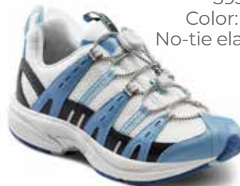
3950 Color: Blue No-tie elastic lace