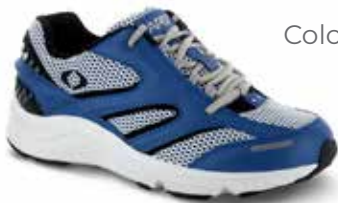
V551M* Color: White/Blue Mesh Lace