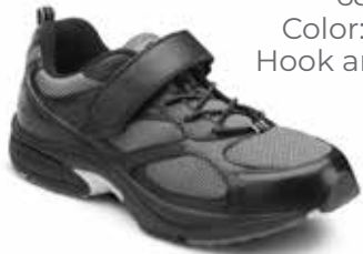
6810 Color: Black Hook and Loop