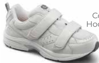
7740 Color: White Hook and Loop