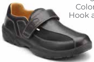
6610 Color: Black Hook and Loop