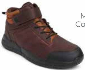
M056-SHOE Color: Whiskey Lace