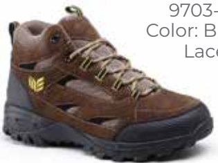
9703-2L Color: Brown Lace