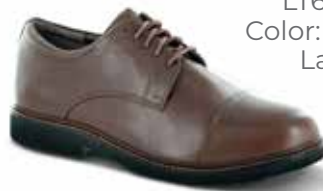
LT610M Color: Brown Lace