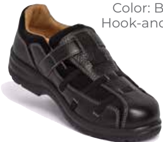
3810 Color: Black Hook-and-loop