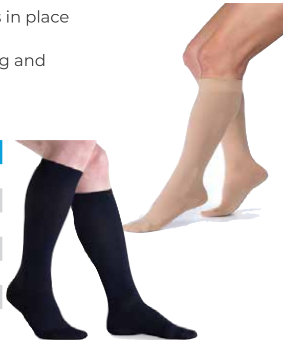
Relief Knee High Open Toe (15-20mmHg)