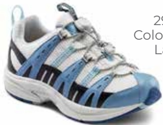
2950 Color: Blue Lace