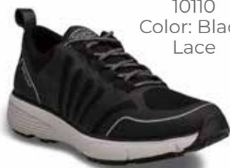
10110 Color: Black Lace