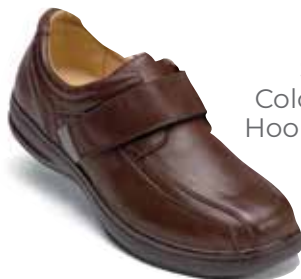
S206-2 Color: Brown* Hook-and-loop