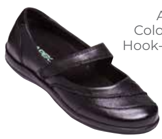
A330 Color: Black Hook-and-loop