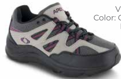
V753W Color: Gray/Purple Lace