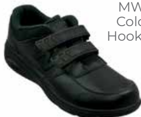
MW813HBK Color: Black Hook-and-loop