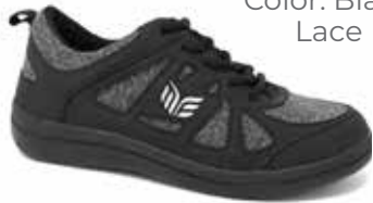
9321-BLK Color: Black Lace