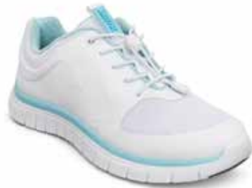
W023-SHOE Color: White Lace