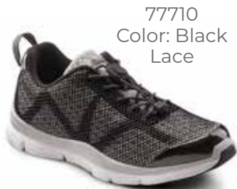
77710 Color: Black Lace