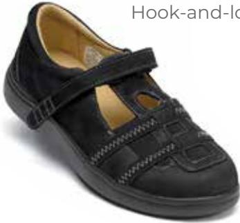
S606-1 Color: Black Hook-and-loop