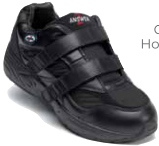
553-1 Color: Black Hook-and-Loop