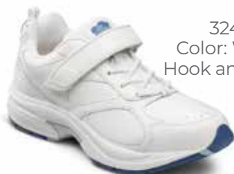
3240 Color: White Hook and Loop