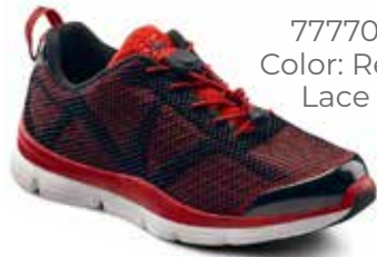
77770 Color: Red Lace