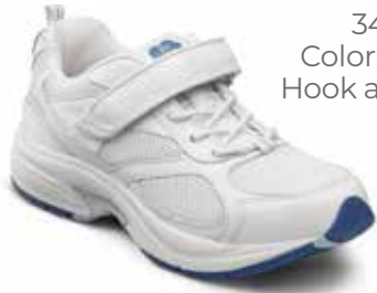
3440 Color: White Hook and Look