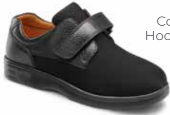
4910 Color: Black Hook and Loop