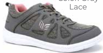
9321-GRY Color: Gray Lace