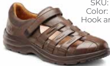
SKU: 0820 Color: Coffee Hook and Loop