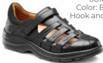
0810 Color: Black Hook and Loop