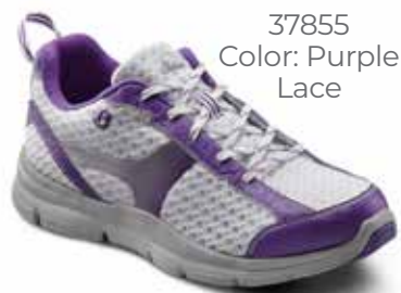
37855 Color: Purple Lace