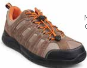
M044-SHOE Color: Stone Lace