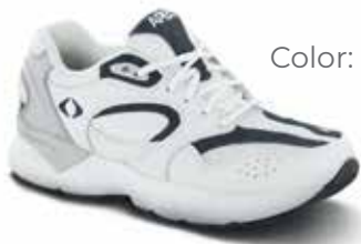
X521M Color: White/Blue Mesh Lace