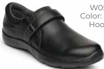
W051-SHOE Color: Black/Gray Hook-and-loop