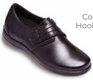
A830 Color: Black Hook-and-loop