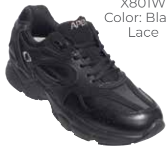
X801W Color: Black Lace