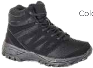
9713 Color: Black Lace