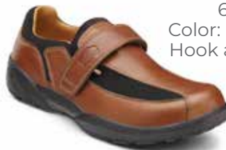
6620 Color: Chestnut Hook and Loop