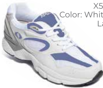
X521W Color: White/Blue Mesh Lace