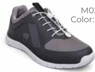
M022-SHOE Color: Gray/Black Lace