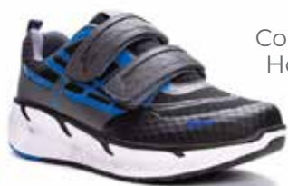
MAA203M Color: Black/Blue Hook and Loop