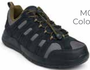
M044-SHOE Color: Dark Gray Lace