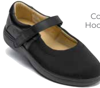
S636-1 Color: Black Hook-and-loop