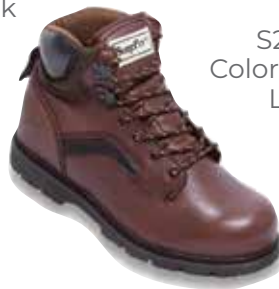
S225-2 Color: Brown* Lace