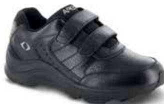
V950M Color: Black Hook and Loop