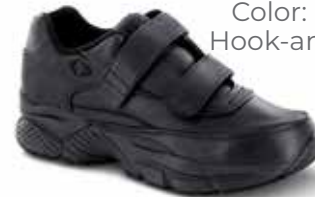
X920M Color: Black Hook-and-loop