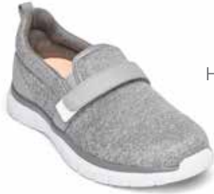
W011-SHOE Color: Gray Hook-and-loop