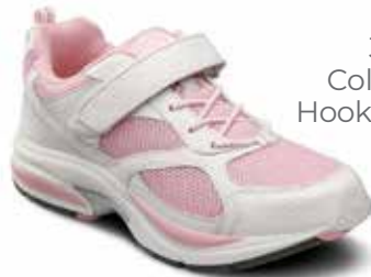
3470 Color: Pink Hook and Look