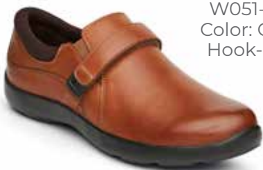
W051-SHOE Color: Cognac Hook-and-loop