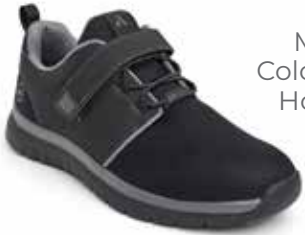
M046-SHOE Color: Black/Black Hook and loop