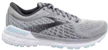
120329-061 Color: Oyster/Alloy/Light Blue Lace