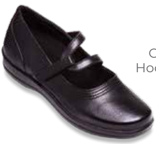
A300 Color Black Hoop-and-loop