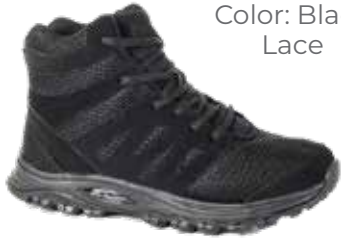
9315-BLK Color: Black Lace