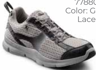
77880 Color: Gray Lace