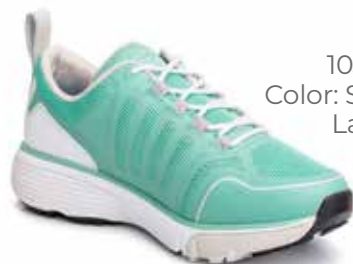
10325 Color: Seafoam Lace