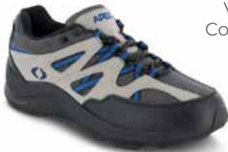
V753M Color: Gray Lace