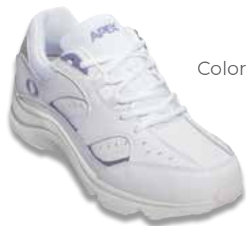
V854W Color: White/Periwinkle Lace