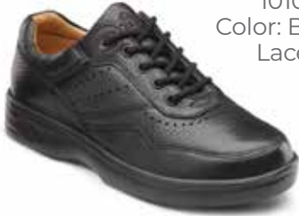
1010 Color: Black Lace