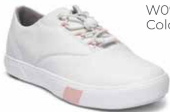
W093-SHOE Color: White Lace