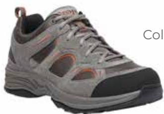
M5503GUO Color: Gunsmoke/Orange Lace