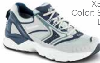
X532M* Color: Silver/Navy Lace