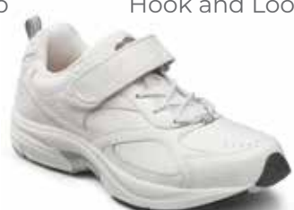
6740 Color: White Hook and Loop