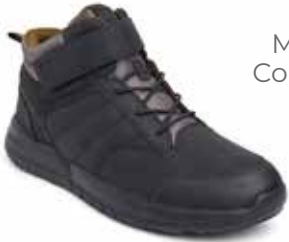
M056-SHOE Color: Oil Black Lace