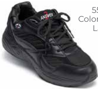
554-1 Color: Black Lace