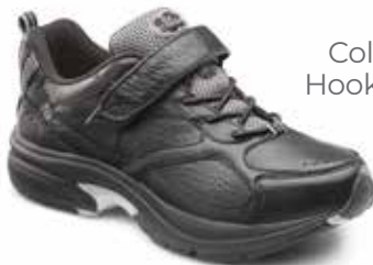
3210 Color: Black Hook and Loop