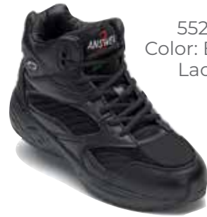
552-1 Color: Black Lace