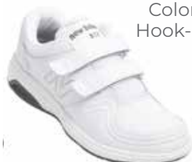
MW813HWT Color: White Hook-and-loop