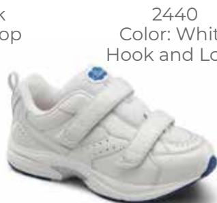
2440 Color: White Hook and Loop