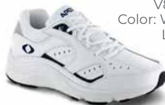
V854M Color: White/Blue Lace