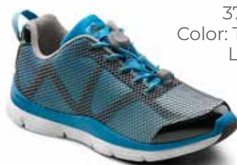
37750 Color: Turquoise Lace