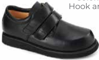
802BK Color: Black Hook and Loop