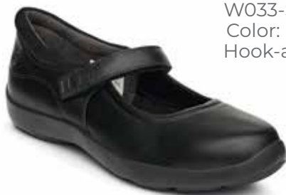
W033-SHOE Color: Black Hook-and-loop