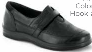
A700W Color: Black Hook-and-loop