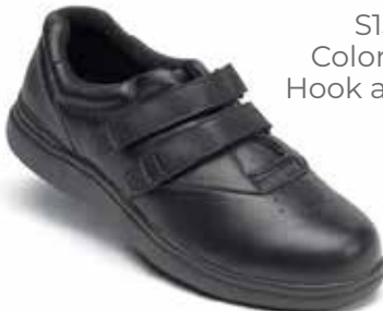
S136-1 Color: Black Hook and Loop