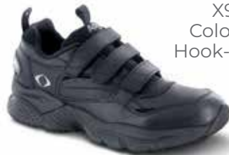
X903M Color: Black Hook-and-loop