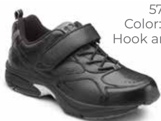
5710 Color: Black Hook and Loop