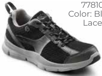
77810 Color: Black Lace