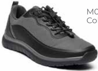
M016-SHOE Color: Black Lace