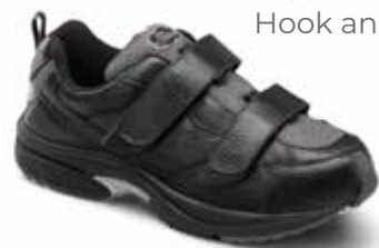
7710 Color: Black Hook and Loop