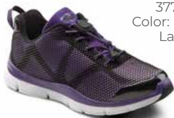
37755 Color: Purple Lace