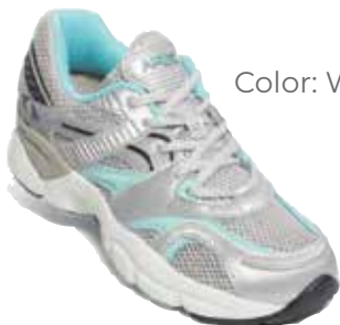
X527W Color: White/Aqua Mesh Lace