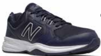
MA411LB1 Color: Navy Blue Lace