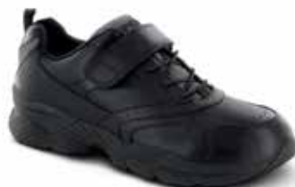
A6000M Color: Black Hook and Loop