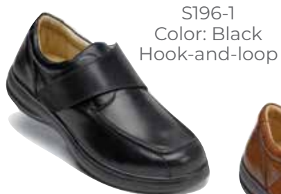
S196-1 Color: Black Hook-and-loop