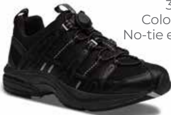
3910 Color: Black No-tie elastic lace