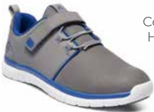
M046-SHOE Color: Gray/Blue Hook and loop