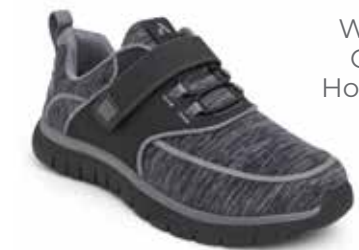
W045-SHOE Color: Gray Hook-and-loop