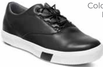
W093-SHOE Color: Black Lace