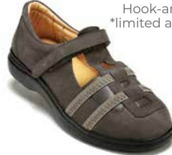
S606-8 Color: Gray Hook-and-loop *limited availability