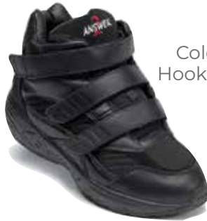
551-1 Color: Black Hook-and-Loop