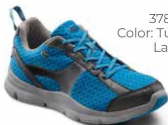
37850 Color: Turquoise Lace