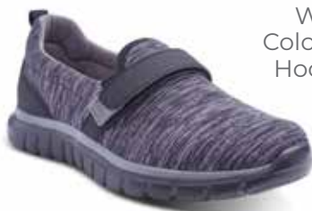
W011-SHOE Color: Black/Gray Hook-and-loop