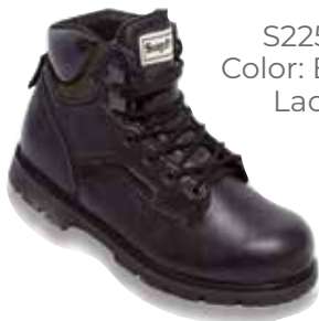
S225-1 Color: Black Lace