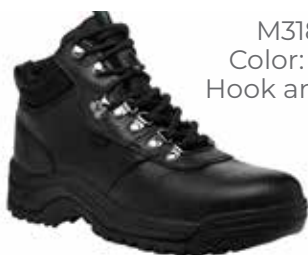
M3188B Color: Black Hook and Loop