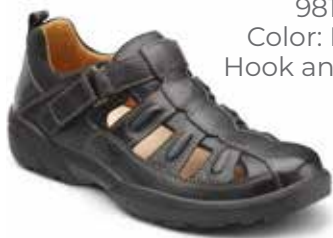
9810 Color: Black Hook and Loop