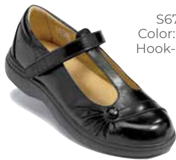
S676-1 Color: Black Hook-and-loop