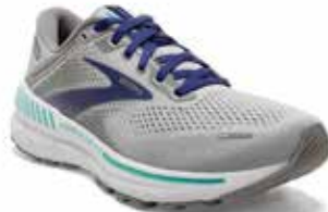
120353-045 Color: Alloy/Blue/Green Lace