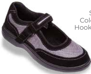
S325-1 Color: Black Hook-and-loop