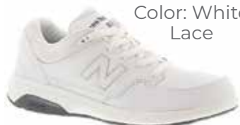
MW813WT Color: White Lace