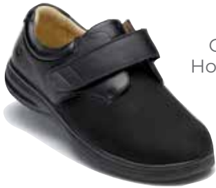
S166-1 Color: Black Hook-and-Loop