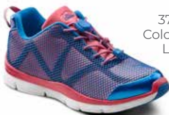
37770 Color: Pink Lace