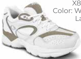
X821M Color: White/Gray Lace