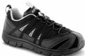
A5000M Color: Black Lace