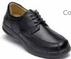
S215-1 Color: Black Lace