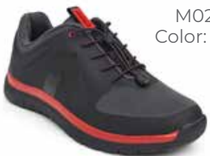
M022-SHOE Color: Black/Red Lace