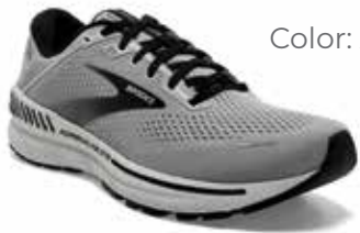
110366-012 Color: Alloy/Gray/Black Lace

*Orders will be filled with available stocked color until inventory has been depleted.