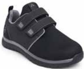
M074-SHOE Color: Black/Gray Hook-and-Loop