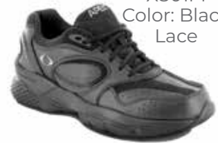
X801M Color: Black Lace