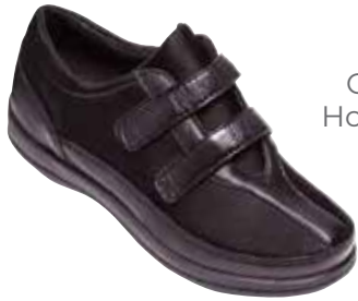
A730 Color: Black Hook-and-loop