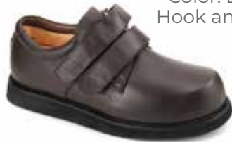
802BR Color: Brown Hook and Loop