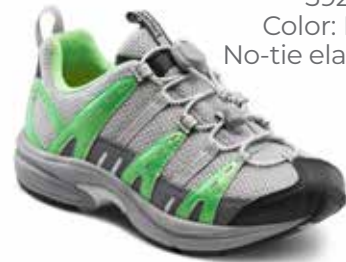
3925 Color: Lime No-tie elastic lace