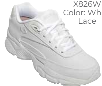
X826W Color: White Lace