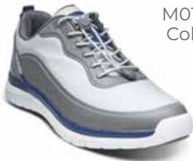
M016-SHOE Color: Gray Lace