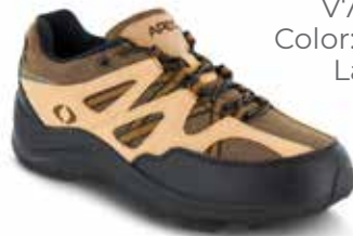
V751M Color: Brown Lace