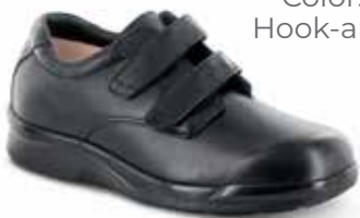
1260M Color: Black Hook-and-Loop