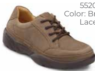
5520 Color: Brown Lace