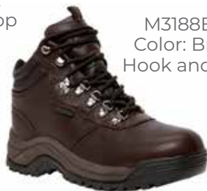
M3188BRO Color: Brown Hook and Loop