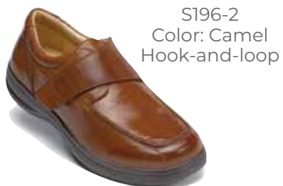
S196-2 Color: Camel Hook-and-loop