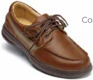
S175-2 Color: Brown Lace