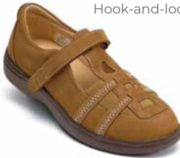
S606-2 Color: Camel Hook-and-loop