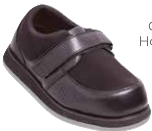
628-E Color: Black Hook-and-loop