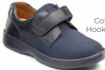
4550 Color: Blue Hook and Loop