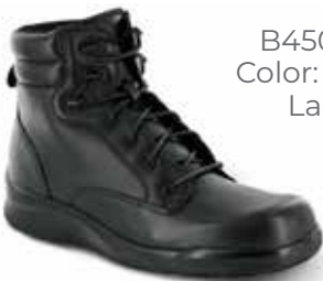
B4500M Color: Black Lace