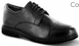
LT600M Color: Black Lace