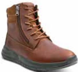
M090-SHOE Color: Whiskey Lace