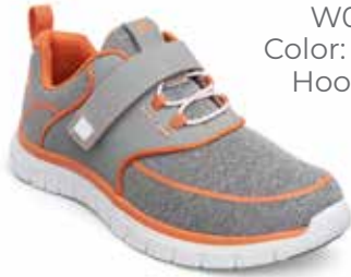
W045-SHOE Color: Gray/Orange Hook-and-loop