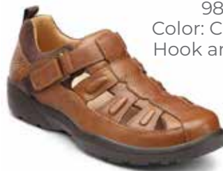
9820 Color: Chestnut Hook and Loop