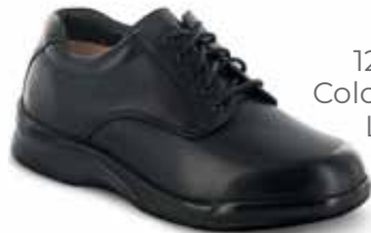
1270M Color: Black Lace