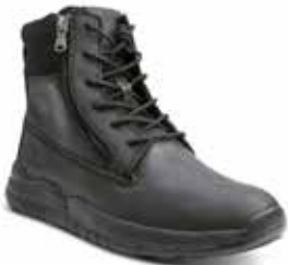
M090-SHOE Color: Oil Black Lace