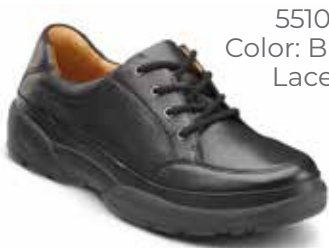
5510 Color: Black Lace