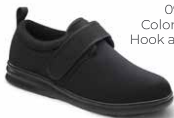
0910 Color: Black Hook and Loop