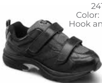
2410 Color: Black Hook and Loop