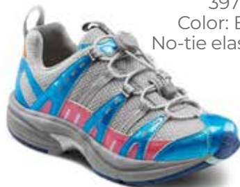
3976 Color: Berry No-tie elastic lace