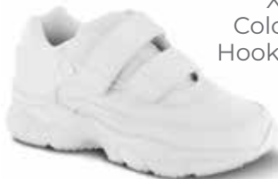
X926M Color: White Hook-and-loop