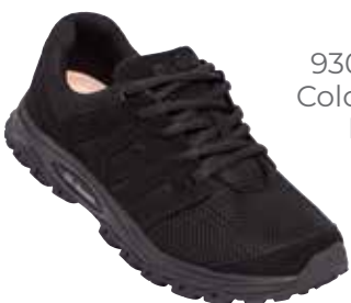
9306-BLK Color: Black Lace