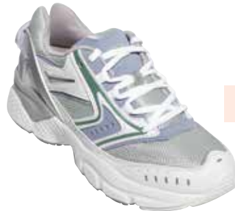
X532W * Color: Silver/Periwinkle Lace