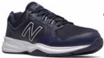
MA411LB1 Color: Navy Blue Lace