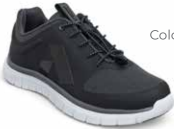
W023-13 Color: Black/Gray Lace