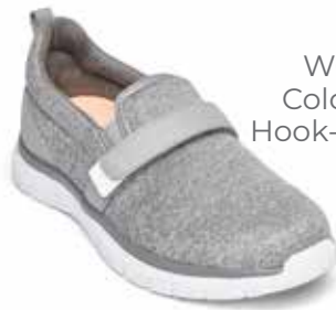
W011-32 Color: Gray Hook-and-loop