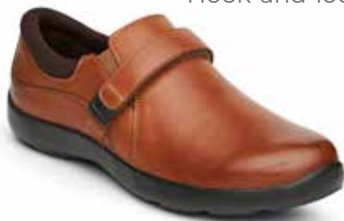
W051-23 Color: Cognac Hook-and-loop