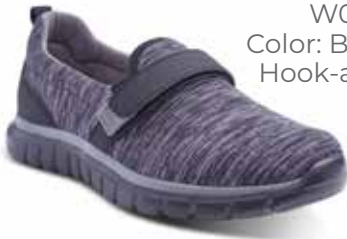
W011-13 Color: Black/Gray Hook-and-loop