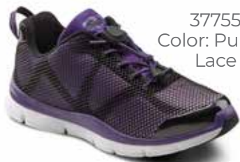
37755 Color: Purple Lace