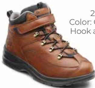
2520 Color: Chestnut Hook and Look