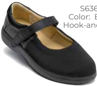
S636-1 Color: Black Hook-and-loop