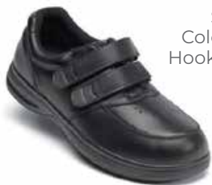
S116-1 Color: Black Hook and loop