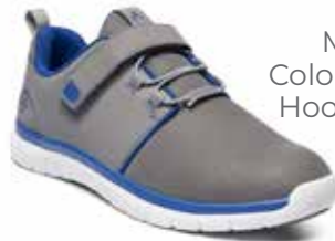
M046-35 Color: Gray/Blue Hook and loop