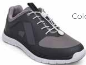
M022-31 Color: Gray/Black Lace