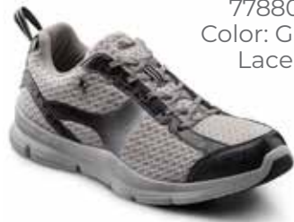
77880 Color: Gray Lace