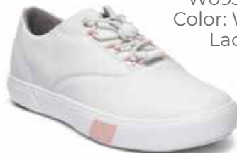
W093-40 Color: White Lace