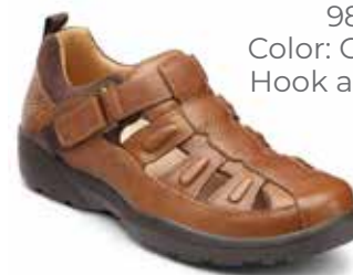
9820 Color: Chestnut Hook and Loop