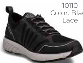
10110 Color: Black Lace