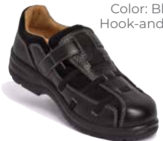
3810 Color: Black Hook-and-loop