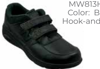
MW813HBK Color: Black Hook-and-loop