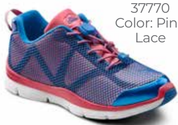
37770 Color: Pink Lace