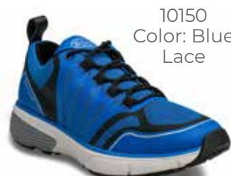
10150 Color: Blue Lace