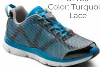
37750 Color: Turquoise Lace