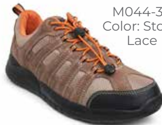
M044-30 Color: Stone Lace