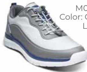
M016-32 Color: Gray/Blue Lace