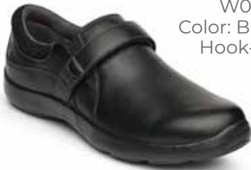
W051-10 Color: Black/Gray Hook-and-loop