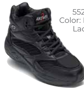
552-1 Color: Black Lace