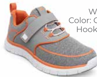
W045-39 Color: Gray/Orange Hook-and-loop