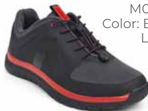
M022-16 Color: Black/Red Lace