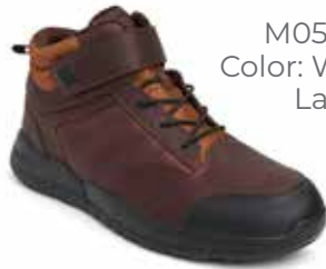
M056-20 Color: Whiskey Lace