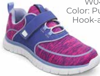
W045-87 Color: Purple/Pink Hook-and-loop