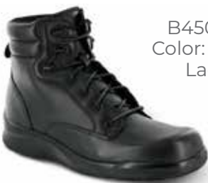
B4500M Color: Black Lace