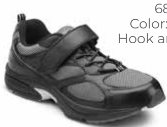
6810 Color: Black Hook and Loop