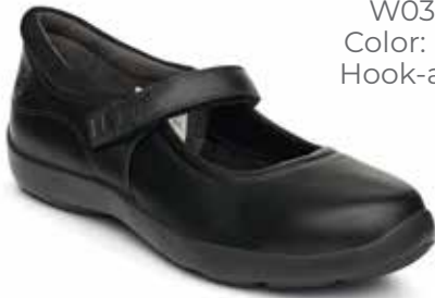
W033-12 Color: Black Hook-and-loop