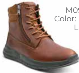
M090-20 Color: Whiskey Lace