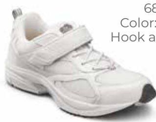
6840 Color: White Hook and Loop