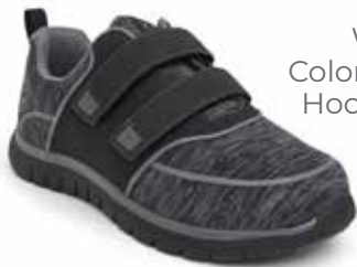
W077-13 Color: Black/Gray Hook-and-loop