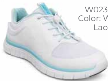
W023-45 Color: White Lace