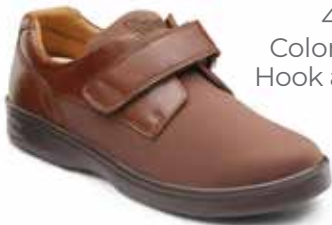
4520 Color: Brown Hook and Loop