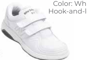
MW813HWT Color: White Hook-and-loop