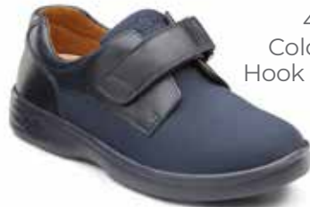
4550 Color: Blue Hook and Loop