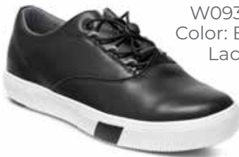
W093-10 Color: Black Lace