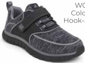
W045-13 Color: Gray Hook-and-loop