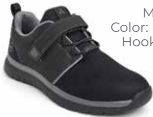
M046-13 Color: Black/Black Hook and loop