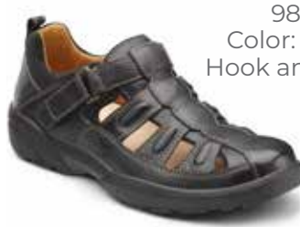
9810 Color: Black Hook and Loop