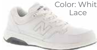
MW813WT Color: White Lace