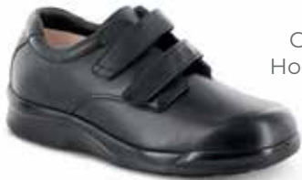
1260M Color: Black Hook and Loop