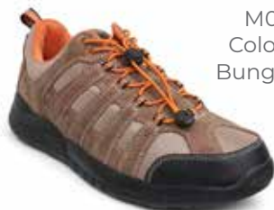
M044-30 Color: Stone Bungee / Lace