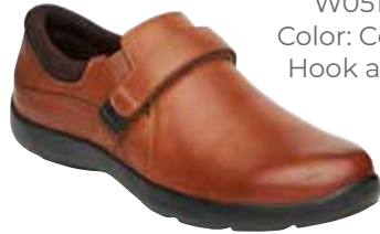
W051-23 Color: Cognac Hook and Loop