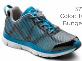
37750 Color: Turquoise Bungee / Lace