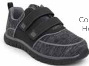
W077-13 Color: Black/Gray Hook and Loop