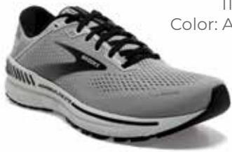
110366-012 Color: Alloy/Gray/Black Lace