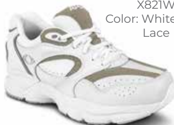
X821W Color: White/Gray Lace