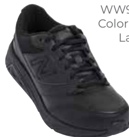
WW928BK Color: Black Lace