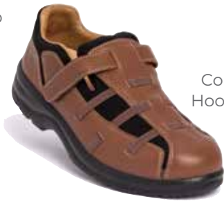
3820 Color: Brown Hook and Loop