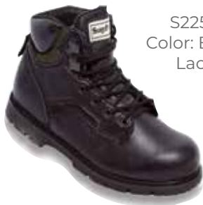
S225-1 Color: Black Lace