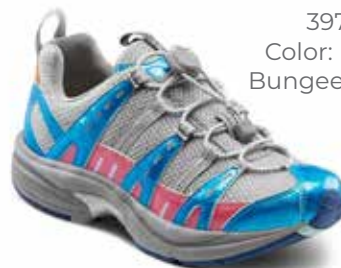
3976 Color: Berry Bungee / Lace