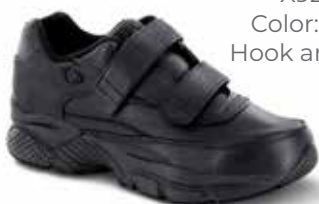
X920M Color: Black Hook and Loop