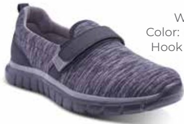
W011-13 Color: Black/Gray Hook and Loop