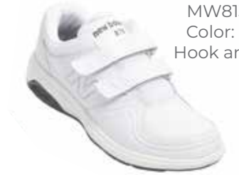
MW813HWT Color: White Hook and Loop