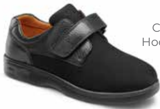
4910 Color: Black Hook and Loop