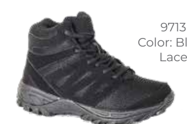
9713 Color: Black Lace