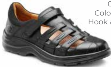
0810 Color: Black Hook and Loop