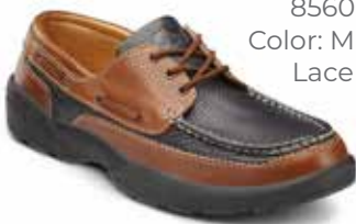
8560 Color: Multi Lace