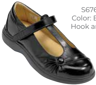
S676-1 Color: Black Hook and Loop