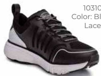
10310 Color: Black Lace