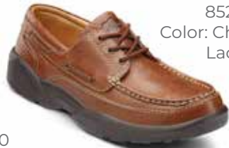
8520 Color: Chestnut Lace