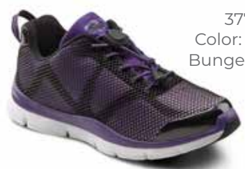
37755 Color: Purple Bungee / Lace