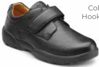
6110 Color: Black Hook and Loop