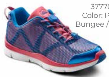
37770 Color: Pink Bungee / Lace