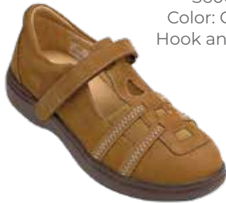
S606-2 Color: Camel Hook and Loop