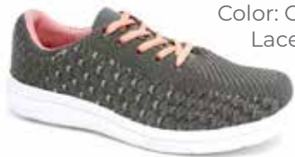
9327-GRY Color: Gray Lace