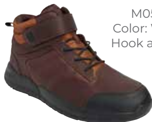
M056-20 Color: Whiskey Hook and Loop