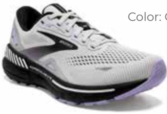
120381-039 Color: Gray/Black/Purple Lace