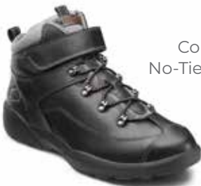
9410 Color: Black No-Tie Elastic Lace