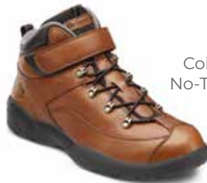
9420 Color: Chestnut No-Tie Elastic Lace