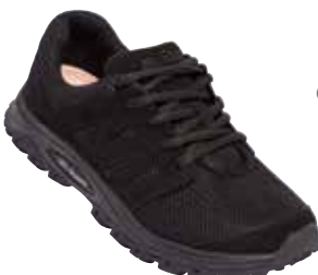
9306-BLK Color: Black Lace