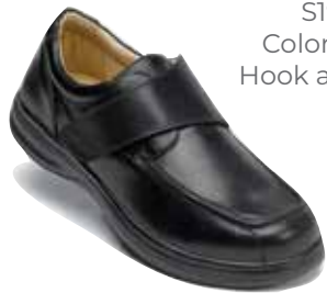
S196-1 Color: Black Hook and Loop