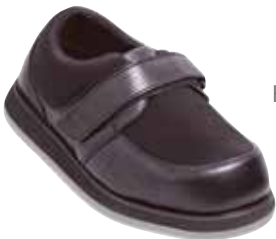
628-E Color: Black Hook and Loop