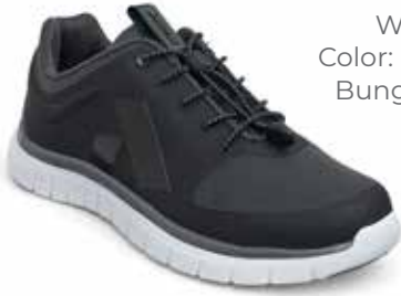
W023-13 Color: Black/Gray Bungee / Lace