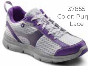
37855 Color: Purple Lace