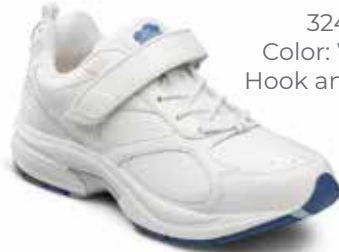
3240 Color: White Hook and Loop