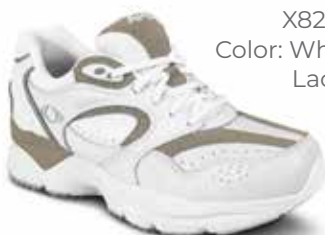
X821M Color: White/Gray Lace