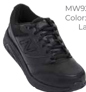
MW928BK3 Color: Black Lace