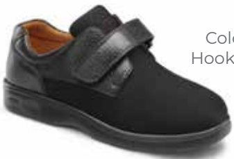
4510 Color: Black Hook and Loop