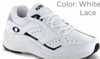
V854M Color: White/Blue Lace