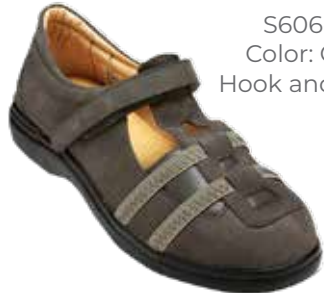
S606-8* Color: Gray Hook and Loop