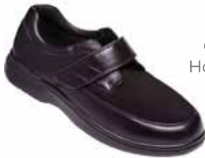
S320-1 Color: Black Hook and Loop