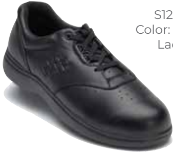
S125-1 Color: Black Lace