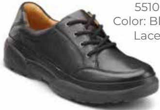
5510 Color: Black Lace