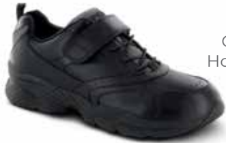
A6000M Color: Black Hook and Loop