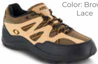
V751M Color: Brown Lace