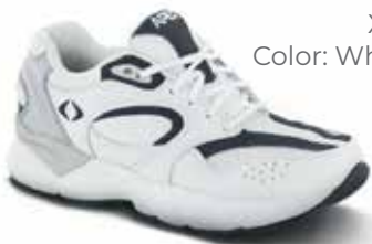
X521M Color: White/Blue Mesh Lace