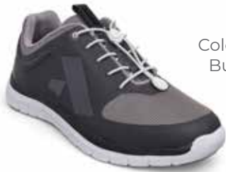
M022-31 Color: Gray/Black Bungee / Lace