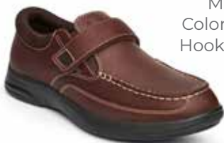
M052-20 Color: Whiskey Hook and Loop