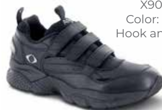
X903M Color: Black Hook and Loop