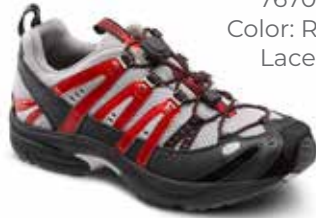
7670 Color: Red Lace