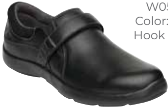
W051-10 Color: Black Hook and Loop