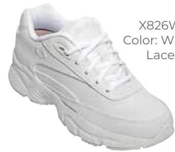
X826W Color: White Lace