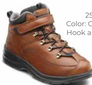
2520 Color: Chestnut Hook and Loop