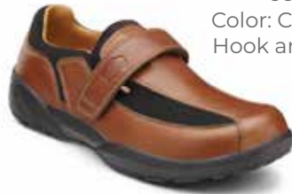
6620 Color: Chestnut Hook and Loop