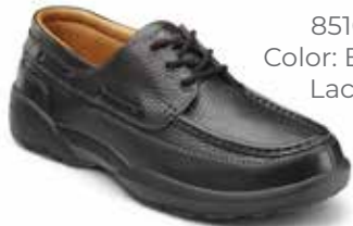
8510 Color: Black Lace