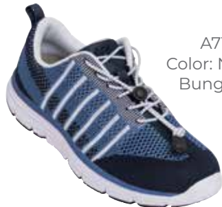
A7100W Color: Navy/Blue Bungee/Lace