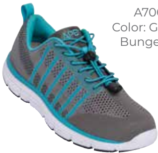
A7000W Color: Gray/Blue Bungee/Lace