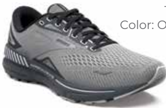
110391-065 Color: Oyster/Ebony/Alloy Lace