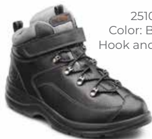
2510 Color: Black Hook and Loop