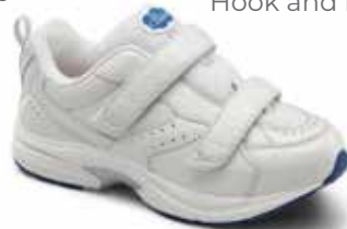
2440 Color: White Hook and Loop