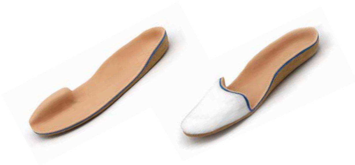
Toe Fill Orthotics for Hallux, Trans Metatarsal and Multi-Toe Amputations