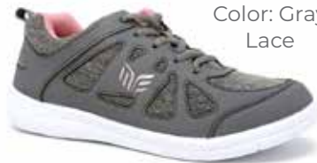
9321-GRY Color: Gray Lace