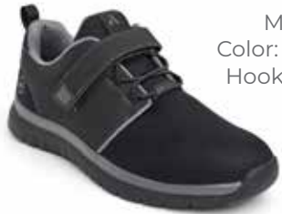
M046-13 Color: Black/Gray Hook and Loop