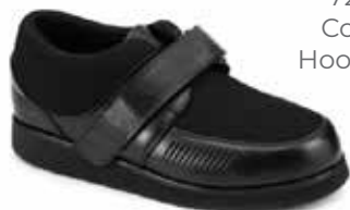
728-E-BLK Color: Black Hook and Loop