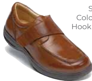
S196-2 Color: Camel Hook and Loop