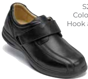
S206-1 Color: Black Hook and Loop