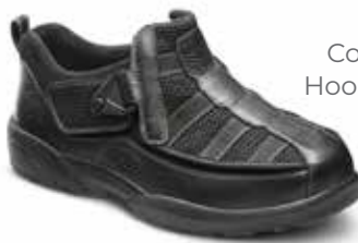
9610 Color: Black Hook and Loop