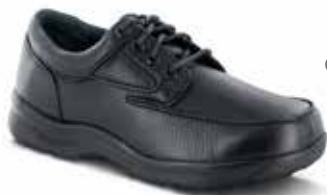
Y900M Color: Black Lace