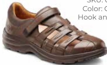
SKU: 0820 Color: Coffee Hook and Loop