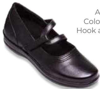
A300 Color Black Hook and Loop