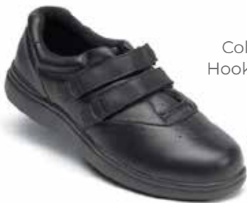
S136-1 Color: Black Hook and Loop