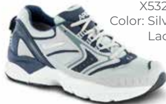
X532M* Color: Silver/Navy Lace