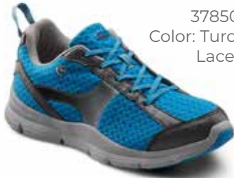
37850 Color: Turquoise Lace