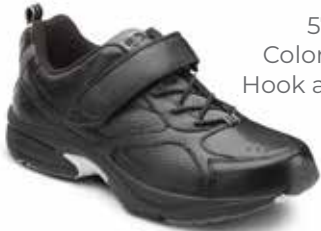
5710 Color: Black Hook and Loop