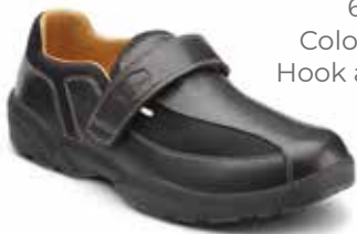
6610 Color: Black Hook and Loop