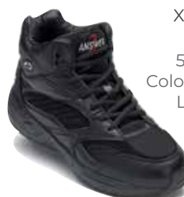
552-1 Color: Black Lace