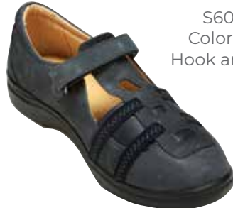
S606-7* Color: Navy Hook and Loop