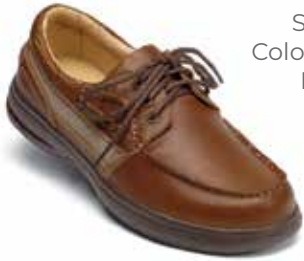
S175-2 Color: Brown Lace