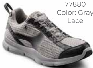
77880 Color: Gray Lace