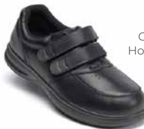
S116-1 Color: Black Hook and Loop