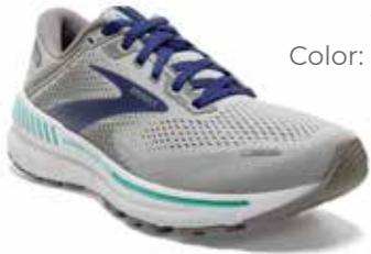
120353-045 Color: Alloy/Blue/Green Lace