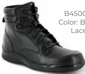
B4500M Color: Black Lace