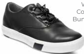
W093-10 Color: Black Bungee / Lace