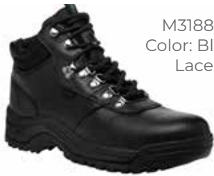
M3188B Color: Black Lace