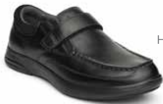
M052-10 Color: Black Hook and Loop