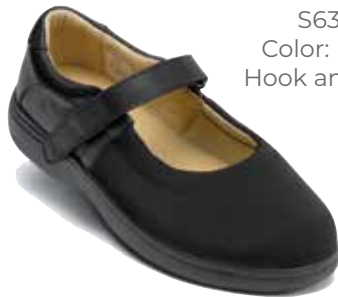
S636-1 Color: Black Hook and Loop