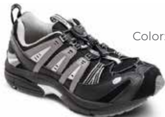
9910 Color: Black/Gray Lace