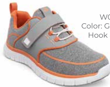
W045-39 Color: Gray/Orange Hook and Loop