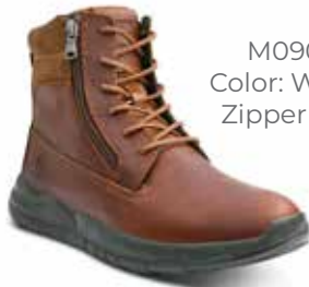
M090-20 Color: Whiskey Zipper / Lace