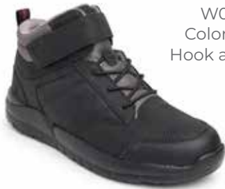
W055-11 Color: Black Hook and Loop