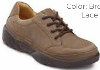
5520 Color: Brown Lace