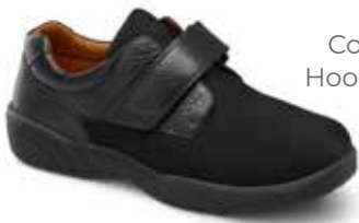
6910 Color: Black Hook and Loop