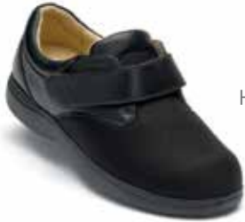
S626-1 Color: Black Hook and Loop