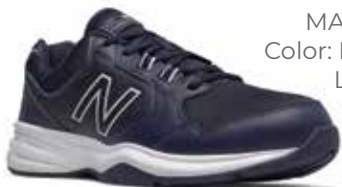
MA411LB1 Color: Navy Blue Lace