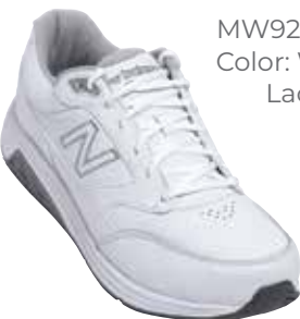
MW928WT3 Color: White Lace