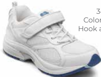
3440 Color: White Hook and Loop