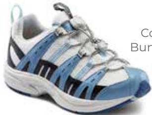
2950 Color: Blue Bungee / Lace