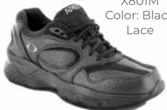
X801M Color: Black Lace