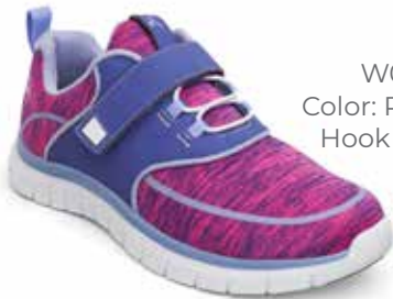
W045-87 Color: Purple/Pink Hook and Loop