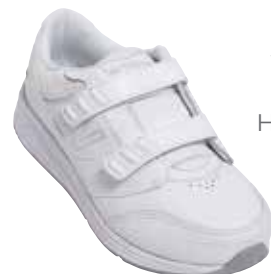
WW928HW3 Color: White Hook and Loop