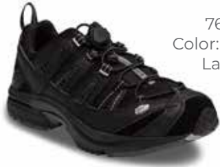
7611 Color: Black Lace