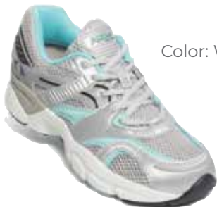
X527W Color: White/Aqua Mesh Lace