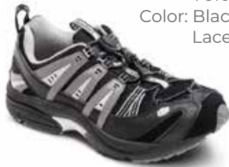
7610 Color: Black/Gray Lace