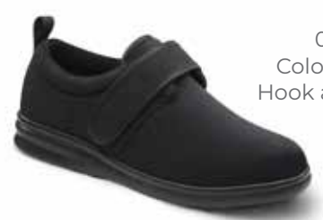
0910 Color: Black Hook and Loop