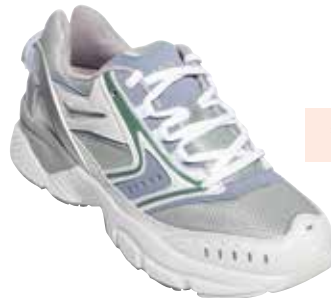
X532W * Color: Silver/Periwinkle Lace