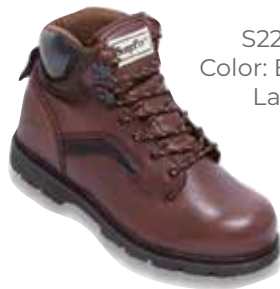
S225-2 Color: Brown* Lace