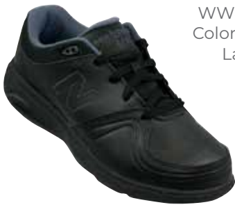
WW813BK Color: Black Lace