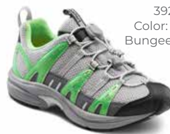
3925 Color: Lime Bungee / Lace