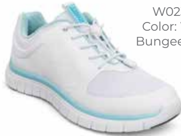
W023-45 Color: White Bungee / Lace