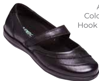
A330 Color: Black Hook and Loop