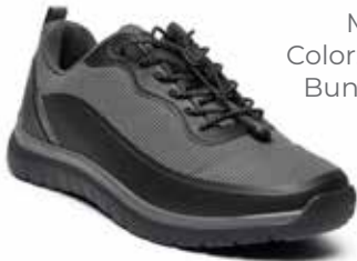
M016-10 Color: Black/Gray Bungee / Lace