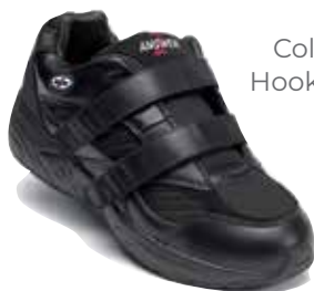
553-1 Color: Black Hook and Loop