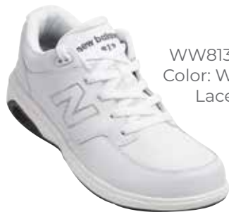
WW813WT Color: White Lace