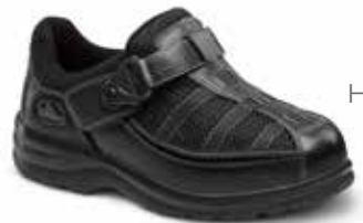
2610 Color: Black Hook and Loop