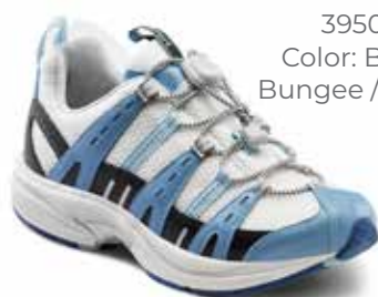
3950 Color: Blue Bungee / Lace