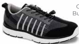
A7000M Color: Black Bungee / Lace