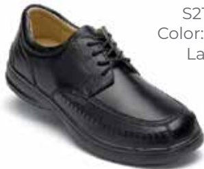
S215-1 Color: Black Lace