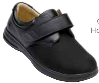
S166-1 Color: Black Hook and Loop