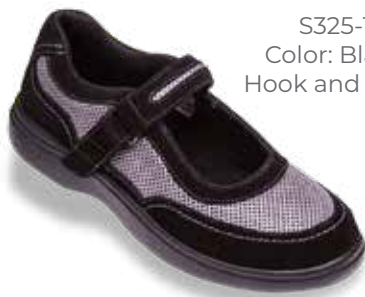
S325-1 Color: Black Hook and Loop