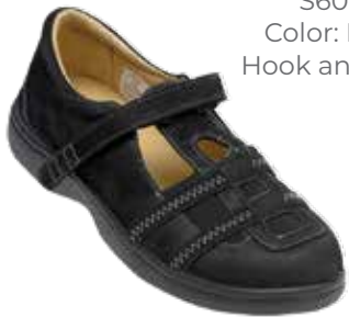
S606-1 Color: Black Hook and Loop