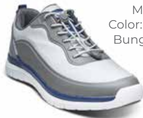
M016-32 Color: Gray/Blue Bungee / Lace