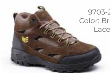
9703-2L Color: Brown Lace