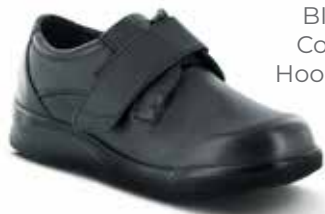
BIO3000M Color: Black Hook and Loop