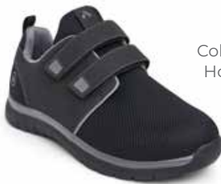
M074-13 Color: Black/Gray Hook and Loop