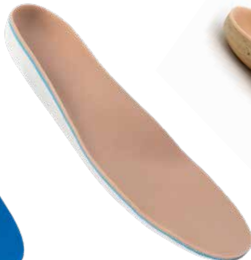
Tri-Laminated EVA Base Accommodative