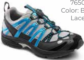
7650 Color: Blue Lace