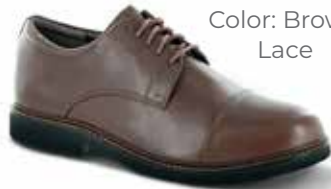
LT610M Color: Brown Lace