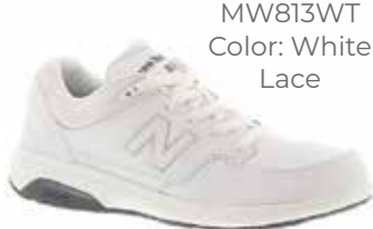
MW813WT Color: White Lace