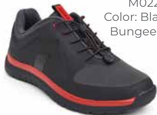
M022-16 Color: Black/Red Bungee / Lace