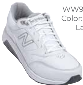
WW928WB Color: White Lace