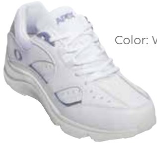
V854W Color: White/Periwinkle Lace