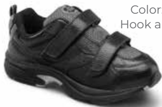
2410 Color: Black Hook and Loop