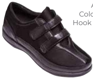
A730 Color: Black Hook and Loop