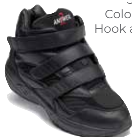
551-1 Color: Black Hook and Loop