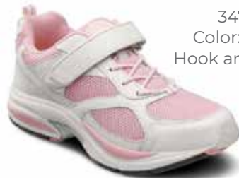
3470 Color: Pink Hook and Loop