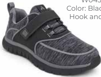
W045-13 Color: Black/Gray Hook and Loop