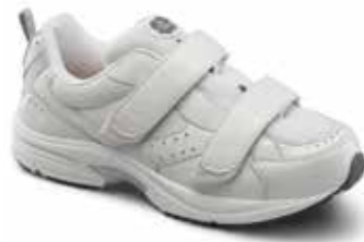
7740 Color: White Hook and Loop