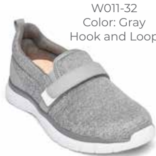
W011-32 Color: Gray Hook and Loop