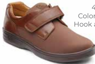
4520 Color: Brown Hook and Loop