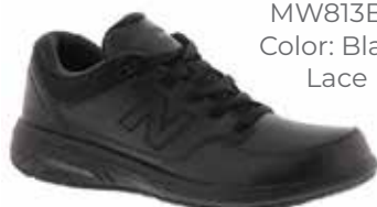
MW813BK Color: Black Lace