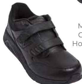
MW928HB3 Color: Black Hook-and-loop