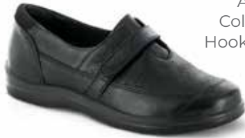
A700W Color: Black Hook and Loop