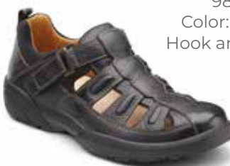
9810 Color: Black Hook and Loop