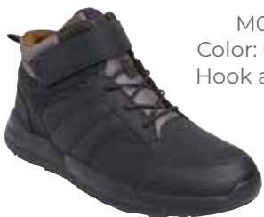
M056-11 Color: Oil Black Hook and Loop