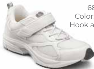
6840 Color: White Hook and Loop