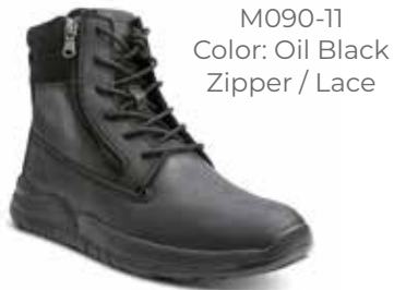
M090-11 Color: Oil Black Zipper / Lace