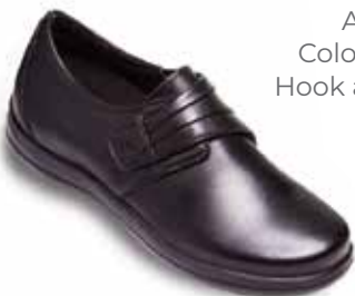
A830 Color: Black Hook and Loop