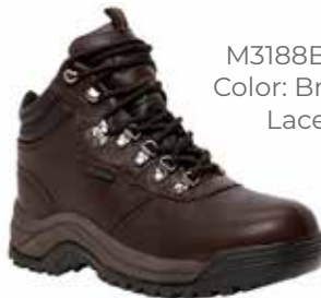
M3188BRO Color: Brown Lace