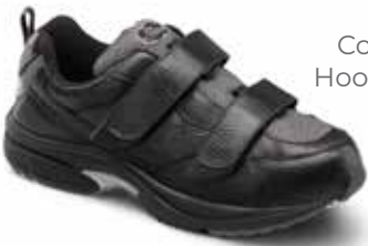
7710 Color: Black Hook and Loop