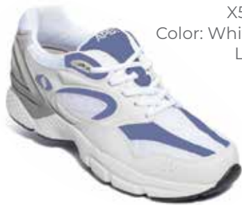
X521W Color: White/Blue Mesh Lace