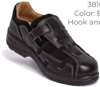
3810 Color: Black Hook and Loop