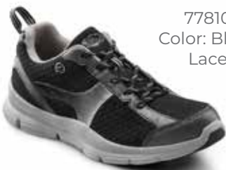
77810 Color: Black Lace