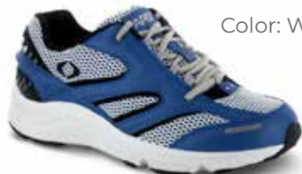
V551M* Color: White/Blue Mesh Lace