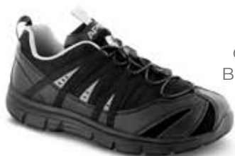
A5000M Color: Black Bungee / Lace