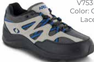
V753M Color: Gray Lace