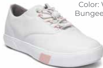
W093-40 Color: White Bungee / Lace