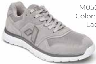
M050-32 Color: Gray Lace