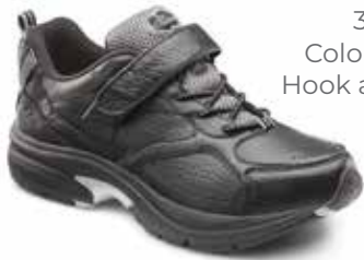
3210 Color: Black Hook and Loop