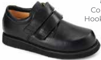
802BK Color: Black Hook and Loop