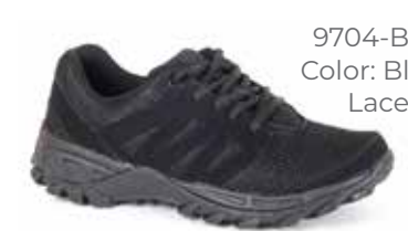
9704-BLK Color: Black Lace