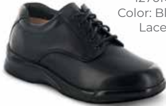
1270M Color: Black Lace