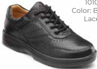
1010 Color: Black Lace