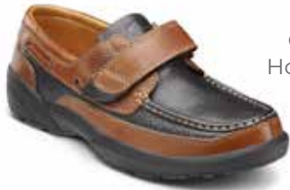
8660 Color: Multi Hook and Loop