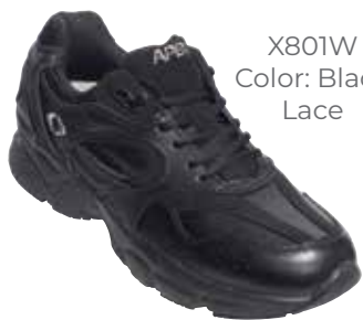
X801W Color: Black Lace