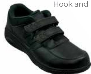
MW813HBK Color: Black Hook and Loop