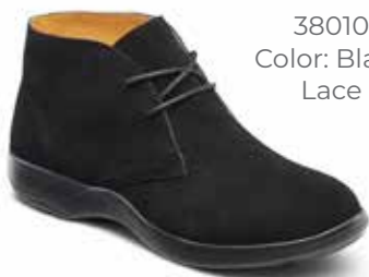
38010 Color: Black Lace