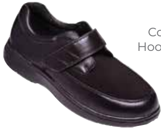
S310-1 Color: Black Hook and Loop