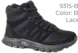
9315-BLK Color: Black Lace