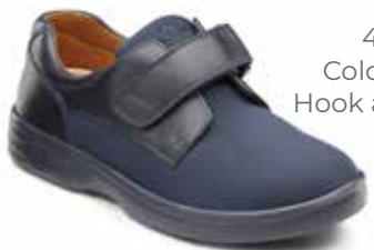
4550 Color: Blue Hook and Loop