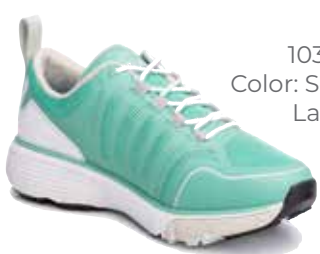
10325 Color: Seafoam Lace