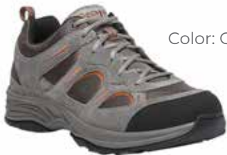
M5503GUO Color: Gunsmoke/Orange Lace