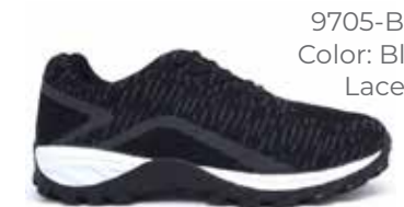
9705-BLK Color: Black Lace