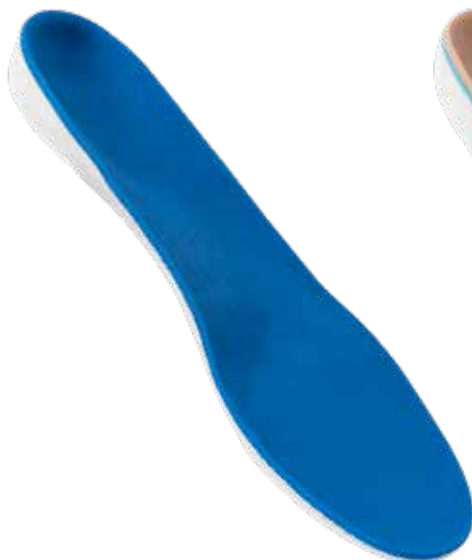
Bi-Laminated EVA Base Accommodative