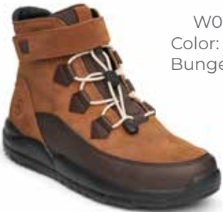
W089-26 Color: Almond Bungee / Lace