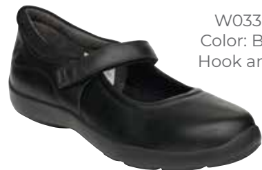
W033-12 Color: Black Hook and Loop