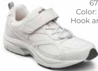
6740 Color: White Hook and Loop