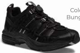
3910 Color: Black Bungee / Lace