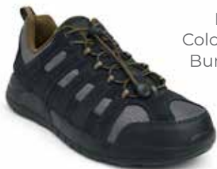
M044-15 Color: Dark Gray Bungee / Lace