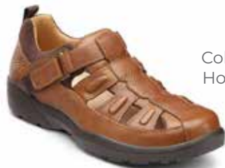
9820 Color: Chestnut Hook and Loop